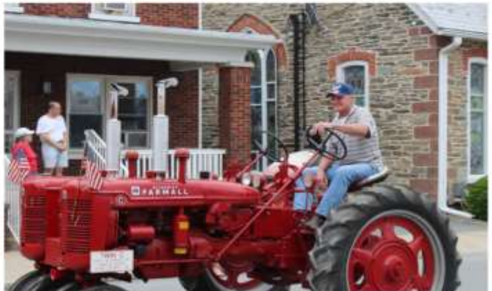
MEMORIAL DAY PARADE 2016