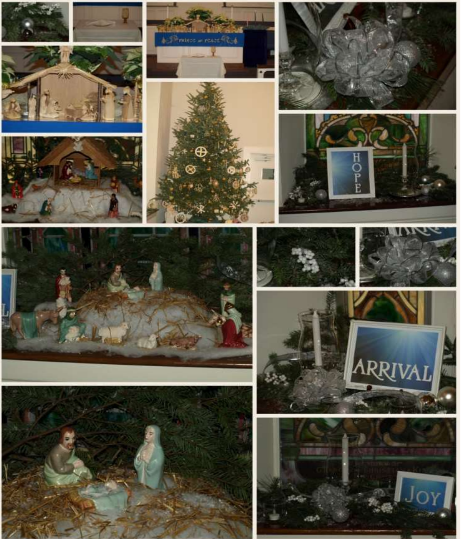
CHRISTMAS AT ZION