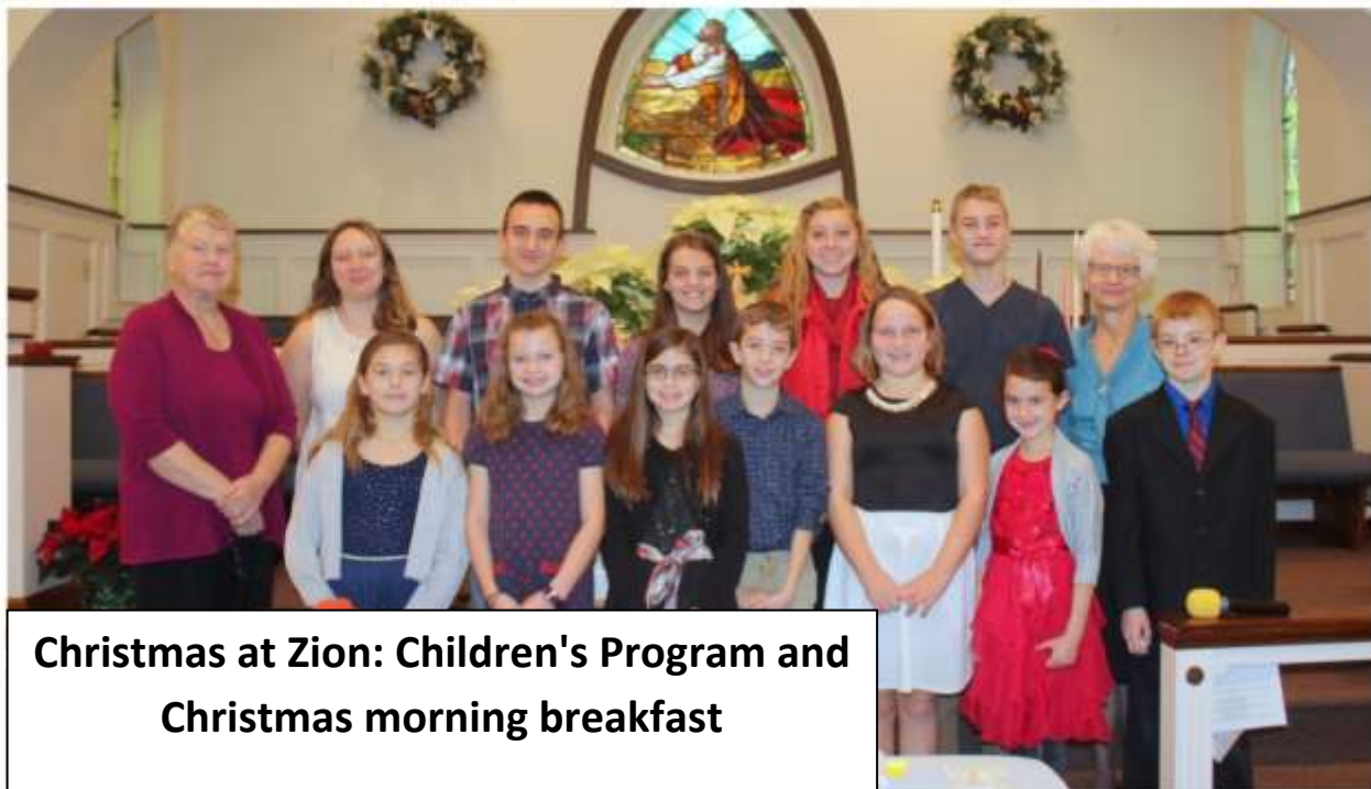
Christmas at Zion: Children's Program and Christmas morning breakfast