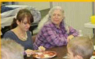
NEW YEAR'S EVE AT ZION