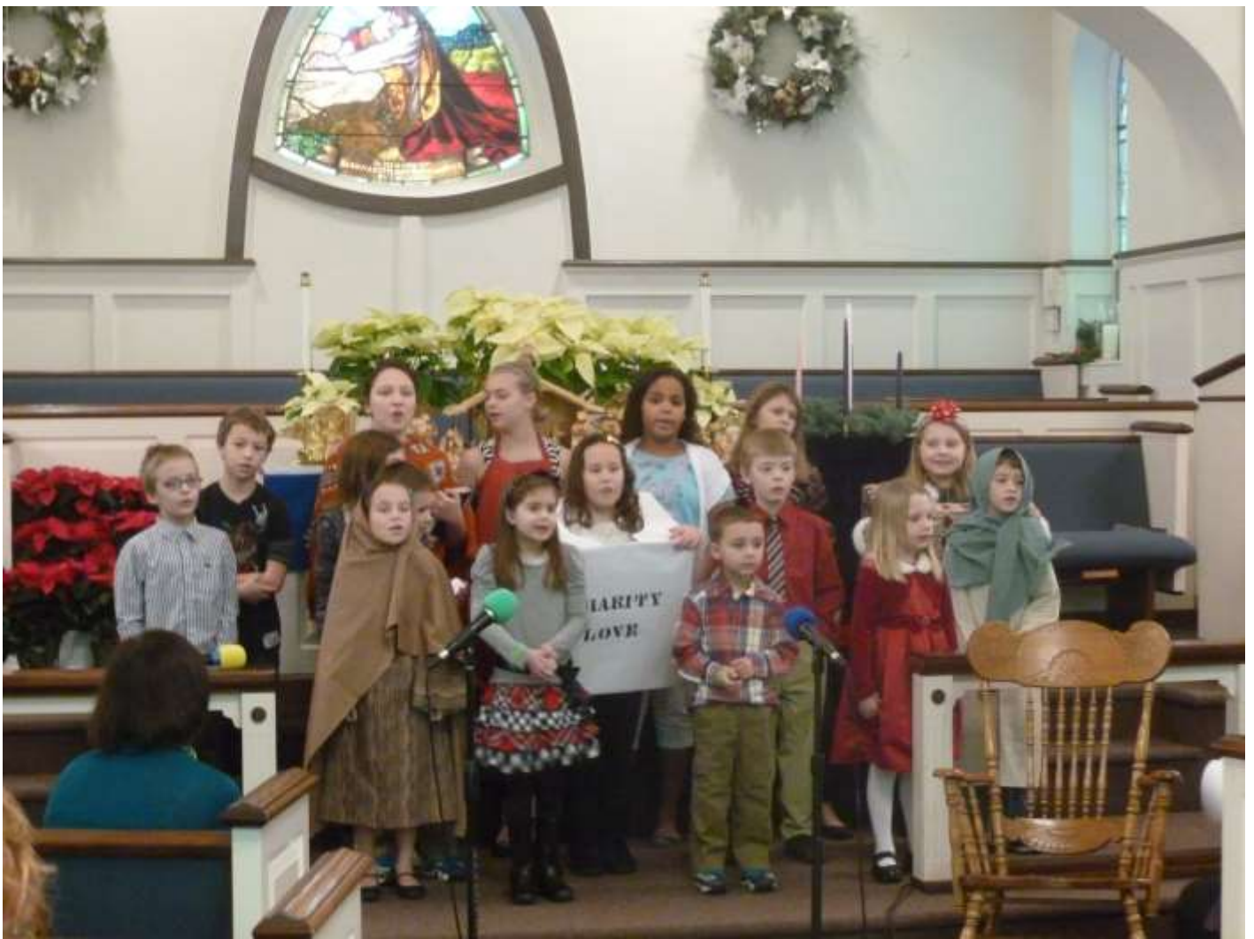
Children's Christmas Play: December 22, 2013 "A Christmas Hide and Seek"